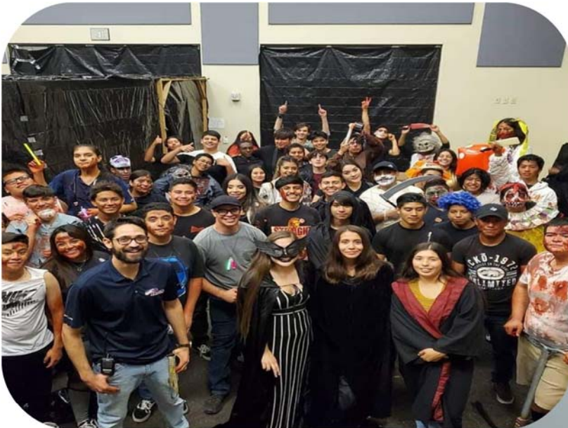
Our Citrus Hill High School student and alumni volunteers that organized and ran the Haunted House during the 2019 Trunk or Treat.

I decided to join the MAC board after hearing of an open position on the board. Before this I was an active volunteer at the community center and a regular attendee of the MAC meetings. I also grew up in Mead Valley! I went to Tomas Rivera Middle School and Citrus Hill High School. I currently teach chemistry and engineering at Citrus Hill High School! Having these unique experiences, I decided that it was best to represent the needs of my community by applying to the open position and being an active participant during our meetings. As a teacher in Mead Valley and MAC member, I am interested in identifying problems and seeking solutions that will help my students, friends, and family enjoy a better quality of life within and beyond our community.