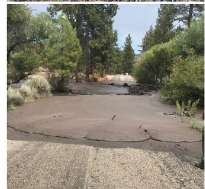
This image is of mud and debris flows after the Cranston Fire on 8/17/18.