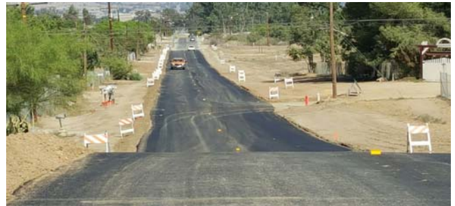
Mapes Road looking east to City of Perris