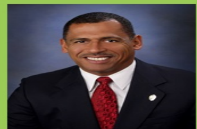
Honorable Mayor Brian Tisdale

Cost: $40 per person $750 for a Reserved Table of 8