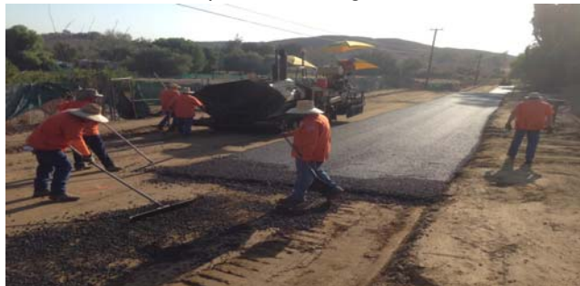
Paving Norma Street early in the morning