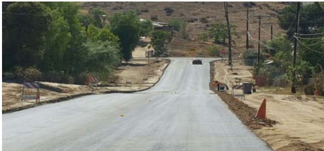
Mapes Road looking west

On Mapes Road, the newly paved portion of the road completes the paving project from where the City of Perris had stopped, to the existing paved road on the western end of Mapes which connects to Betty Road, and then on to Highway 74. Like the residents of Norma Street, several of them had met with our office to ensure that the final portion would indeed be paved and to review timelines for the process to begin. Locals were happy to have the road completed. Huge thank you to our Transportation Department for all their help! Great job, team!