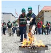
Fire suppression safety

WHEN: March 11-13, 2016 (Three days Fri., Sat. & Sun.)