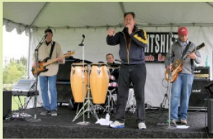
Nightshift performs Classic Rock

Come and learn more about Temescal Valley's heritage, history, and future, the Temescal Heritage Foundation, and the We Are TV Citizens Group.