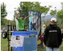
Raising money for a Buddy Bench