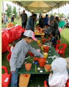
Free Crafts for the kids