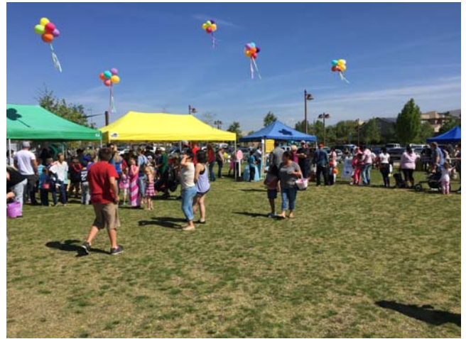
Over 1500 attended Easter Festivities at Deleo Regional Park. It was a blast for everyone who attended. Games and goodies for all the kids too! (above)