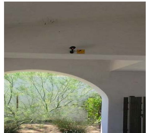
Thanks to a donation from a local business owner, cameras were recently installed at the Mead Valley Community Center.