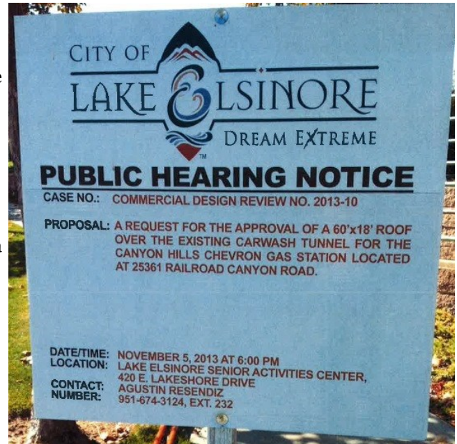
This sign is similar to the new ones required by the county.