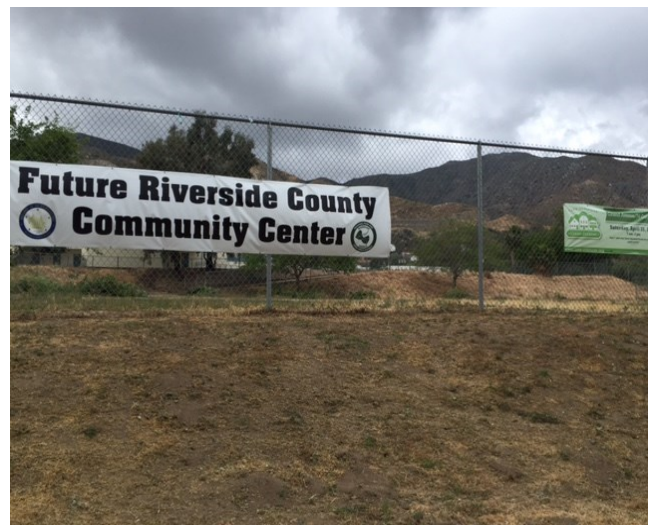
Supervisor Kevin Jeffries and Lake Elsinore City Councilmembers at a recent Clean Extreme Community event with local residents who braved cloudy skies and cold temperatures to clean up areas in the city and county which included the future community center in Lakeland Village.