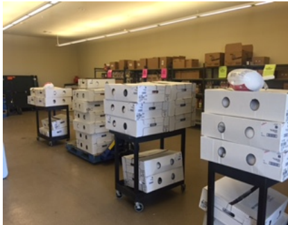
Turkeys awaiting distribution