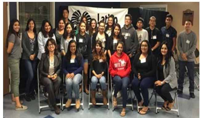
Local students who participated in the 2015 Leadership program