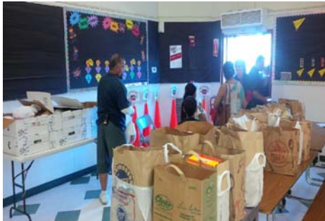
Good Hope Elementary School

In Good Hope, our District 1 team collaborated with teachers from Good Hope Elementary who donated gift bags with all the trimmings to go along with the turkeys. Big thanks to all the staff at Good Hope Elementary for their assistance with the distribution and assistance for the community.