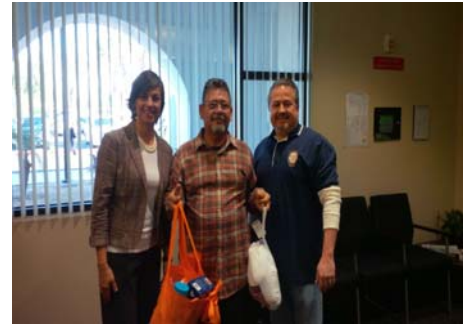
Mead Valley resident picking up his goodies