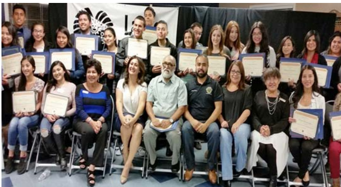
Members of the Latino Network Board of Directors with students.