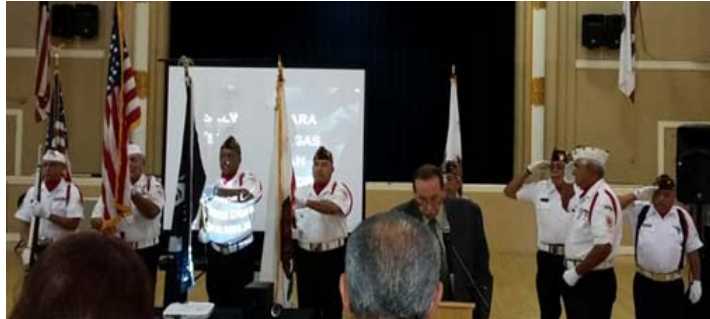
Veterans presenting the colors at opening ceremonies.