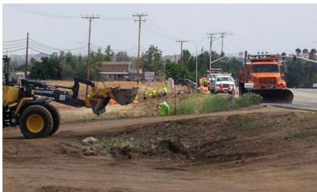
Cal-Trans working with County Transportation Dept. clear away mud and debris which had crossed Hwy 74 at Theda.