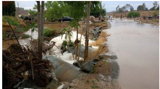
Water pours over Marie St. even after the rain had stopped.