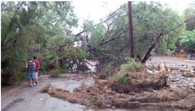
Trees & power lines down on Norma Street, south of Hwy 74.

On July 19th a torrential downpour of rain hit the Good Hope & Meadowbrook areas of District #1. Within minutes, walls of water made their way down hills, roads, through homes, and closed several roads. Thankfully no one was injured and the recovery process has been in gear for sometime now. The clean up is still on going and could potentially take several more weeks to clear all of the water ways and culverts. Below are a few images.