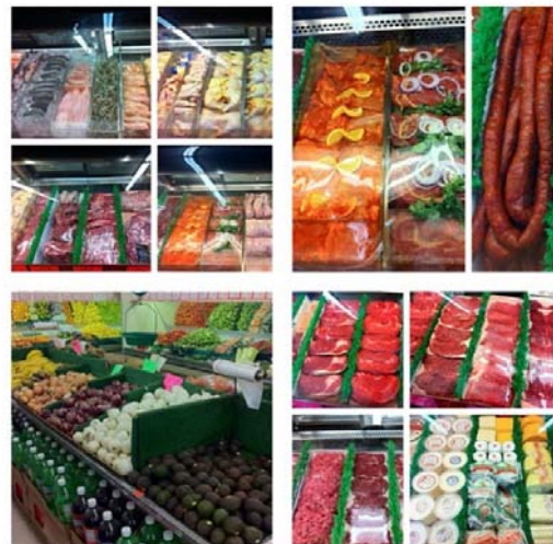
Fresh fruits, meats and more all at Midway!