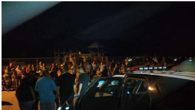
Good Hope / Meadowbrook Halloween