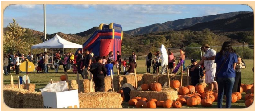
Deleo Park featured pumpkin patch, train rides, petting zoo and more!