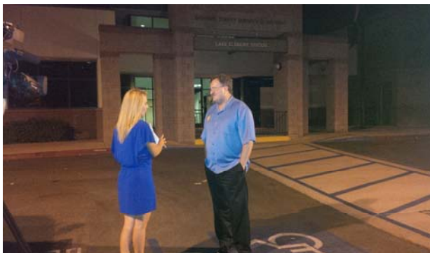
Supervisor interviewing with KNBC about grows in District 1

Regional news outlets such as KNBC and Telemundo 52 have also requested interviews and further clarification of how these grows are affecting local neighborhoods and how the new ordinance will affect the larger grows.