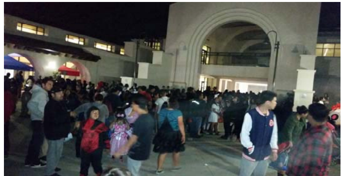
Haunted Maze, games and candy brought out many to Mead Valley