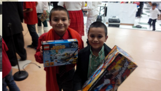
Here you can see the results of the play, dinner, and toy handout held at the Good Hope Elementary School...very happy smiling faces of young kids!