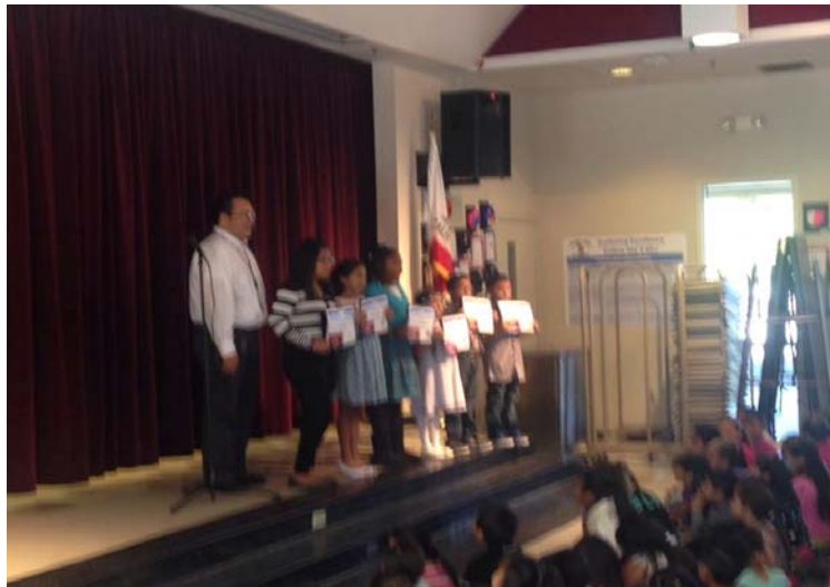
Manuel Real Elementary in Mead Valley