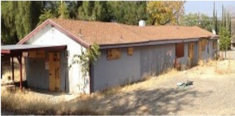
Frightening Fact: The county spent $420,000 to buy this building in 2011

Many local residents expressed their gratitude to our office for having solved the mystery and “exorcised” the hauntings which existed in their neighborhood.