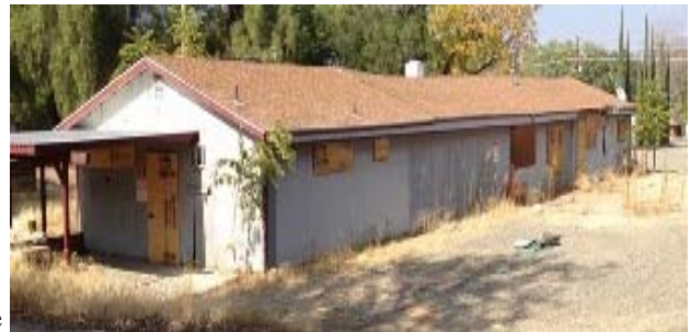
Frightening Fact: The county spent $420,000 to buy this building in 2011

Well, it didn't take long for the rookie Supervisor and his sidekicks to discover that contrary to local lore about the invisible trail being used by ghosts to buy chocolate milk at De Jong's Dairy, it turns out that this trail had simply never been built! Apparently when the county put the contract out to bid, it was awarded to a company that then disappeared! Well, actually it went bankrupt, but same thing, right? By then, the City of Wildomar had incorporated and become its own redevelopment agency, and the City and County decided not to re-issue the bid to build the trail. And then after that, redevelopment agencies were outlawed by the state. But at least we can now spend that $400,000 elsewhere in the community, right?