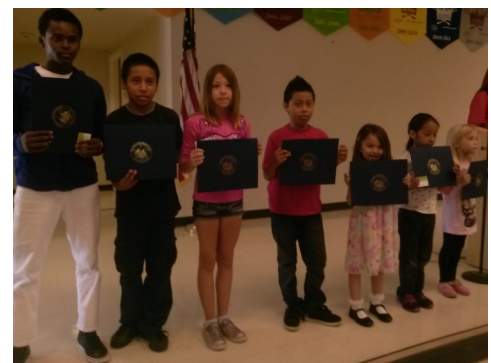
Pictured: Woodcrest Elementary Students