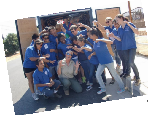
1st District YAC members cleaned up the trail on Rider Street for the opening of the Mead Valley Community Center, 8-17-13.