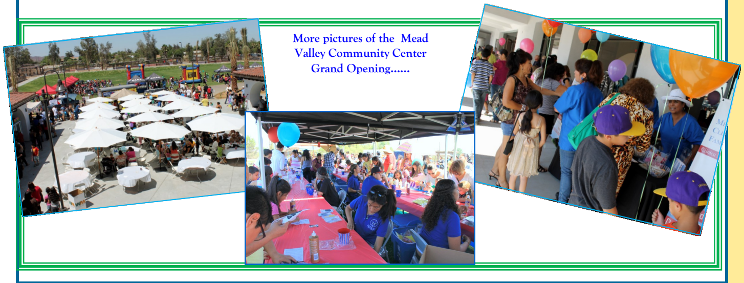
More pictures of the Mead Valley Community Center Grand Opening.....