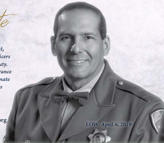
EOW: April 6, 2019

RSVP: nicole.wilkinson@riversidesheriff.org 951.955.2469