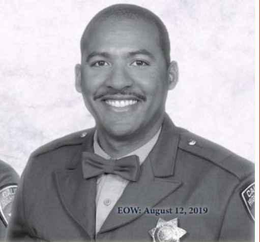
EOW: August 12, 2019