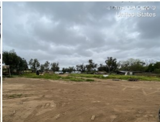
BEFORE AND AFTER IN MEAD VALLEY